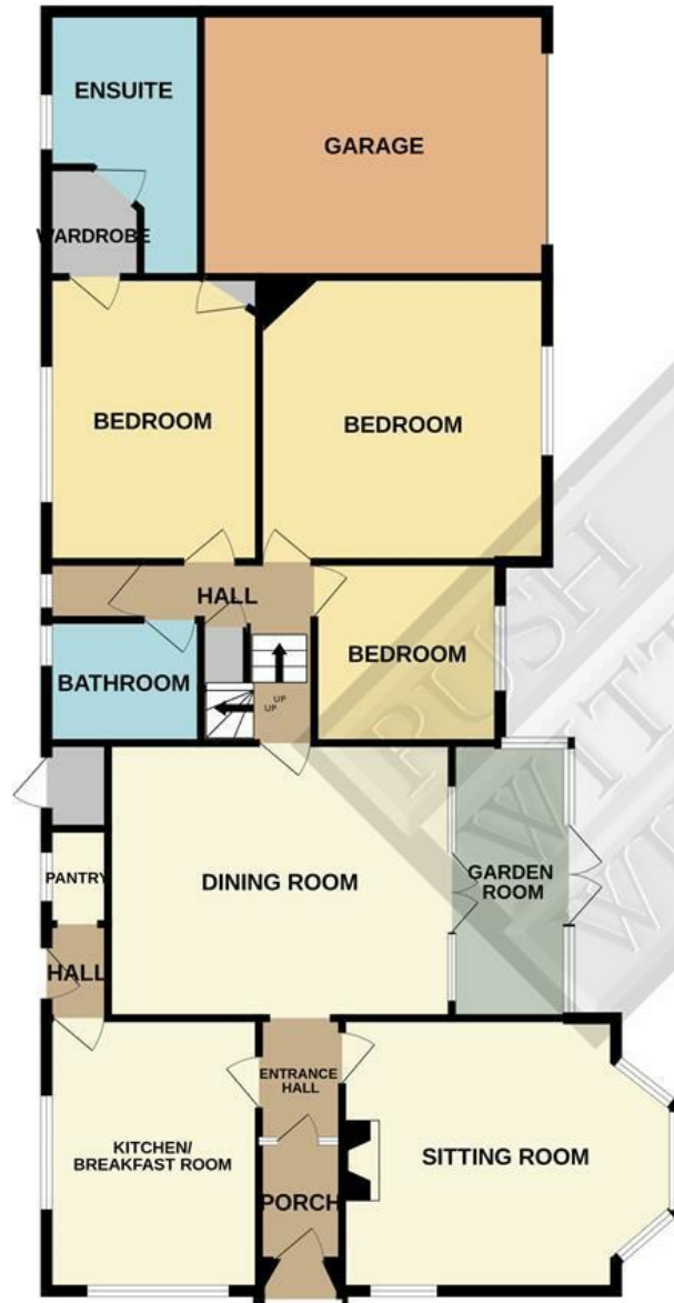
1ST FLOOR 1068 sq.ft. (99.2 sq.m.) approx.